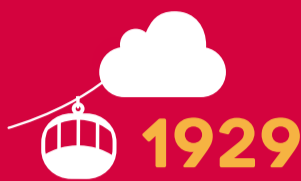
Table Mountain Aerial Cableway has been operating since 4th October 1929 .