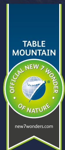
TABLE MOUNTAIN WAS VOTED ONE OF THE NEW 7 WONDERS OF NATURE IN 2011.

The height of Table Mountain at its highest point, Maclear's Beacon , is 1 085m above sea level .